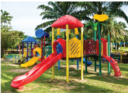
Age Specific Children's park Senior citizen Park